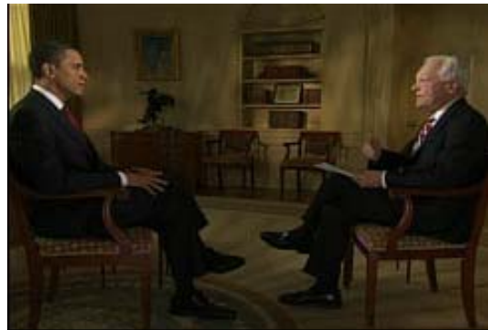
On Face the Nation , President Obama backs away from his campaign promise to renew an assault weapons ban.

Once in office, however, the Obama Administration took the same approach as the Bush White House regarding assault weapons , publicly claiming to support the ban but expending no political muscle to reinstate it. Mr. Obama also took a page from the NRA by falsely claiming that simply enforcing the laws on the books will achieve the best result, even though the laws on the books currently allow the purchase of limitless quantities of semi-automatic assault weapons without background checks at gun shows.