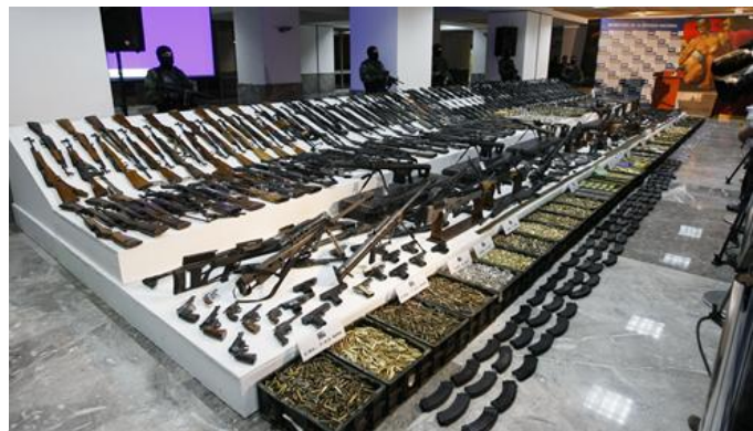
Arms seized in Mexico: 540 assault rifles, seven .50 caliber sniper rifles and 500,000 rounds of ammo.

Following President Obama’s election, gun trafficking was thrust into the spotlight as reports showed that illegal guns were not only flooding into the criminal market in the U.S., but also pouring across the border into the hands of murderous drug gangs in Mexico. 39 Mexican Attorney General Eduardo Medina Mora stated, “It’s truly absurd that a person can get together 50 to 100 high-powered arms, grenade launchers, fragmentation grenades,