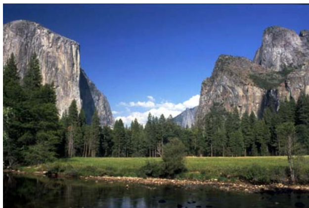
President Obama signed legislation repealing the Reagan Administration’s ban on guns in parks.

The Bush rule was opposed by the Brady Campaign to Prevent Gun Violence and a coalition of national parks groups,